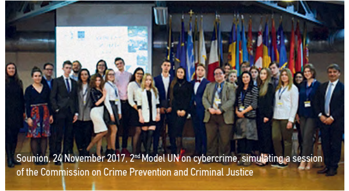
Sounion, 24 November 2017, 2 nd Model UN on cybercrime, simulating a session of the Commission on Crime Prevention and Criminal Justice