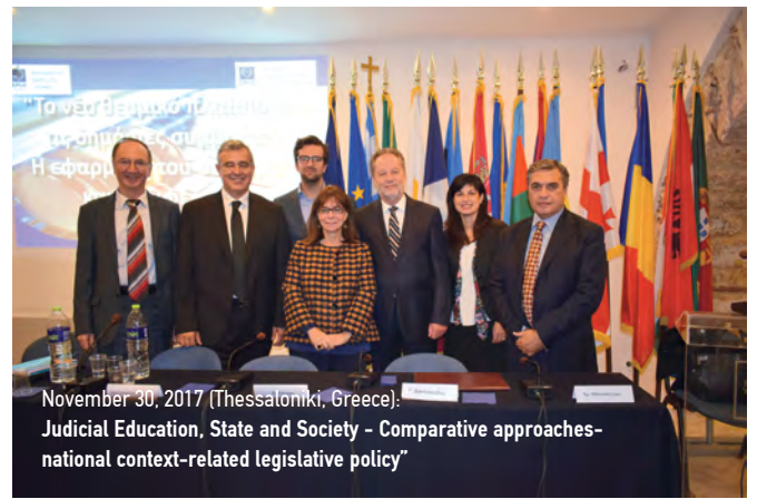
November 30, 2017 (Thessaloniki, Greece): “Judicial Education, State and Society - Comparative approaches- national context-related legislative policy”