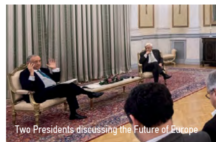
Two Presidents discussing the Future of Europe