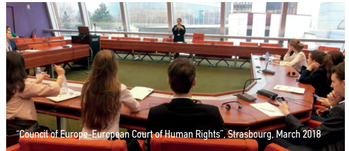
"Council of Europe-European Court of Human Rights", Strasbourg, March 2018