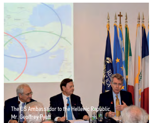
The US Ambassador to the Hellenic Republic, Mr. Geoffrey Pyatt