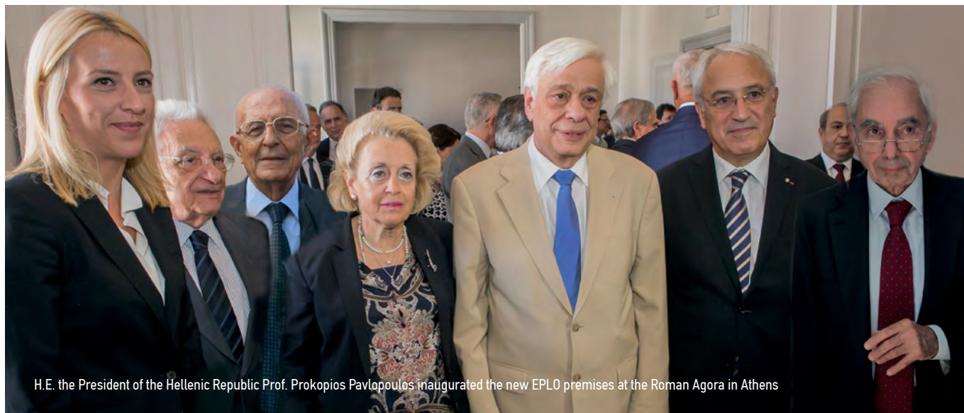
H.E. the President of the Hellenic Republic Prof. Prokopios Pavlopoulos inaugurated the new EPLO premises at the Roman Agora in Athens

The speeches pronounced on the occasion of this event, during which the neoclassical building in Polygnotou street was handed over to Prof. Giuliano Amato by the Regional Governor of Attica Ms. Rena Dourou, as the Attica Region undertook the restoration of the building, have been published in a special Stand-alone edition.