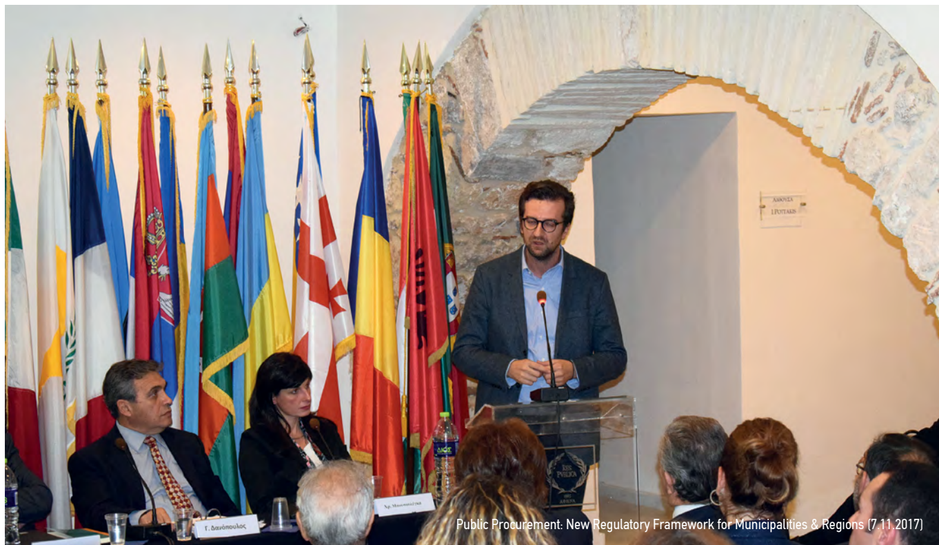
Public Procurement: New Regulatory Framework for Municipalities & Regions (7.11.2017)