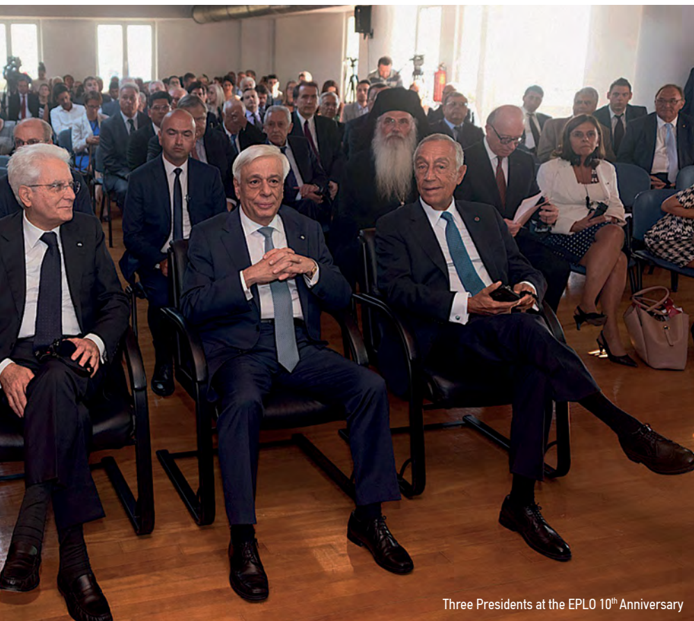
Three Presidents at the EPLO 10 th Anniversary