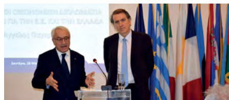
International Lecture "Manuel Chrysoloras" EPLO Kolonaki premises, Athens, Greece