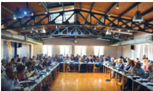
The 28 th Reunion of the EGPL EPLO Sounion premises, Attica, Greece