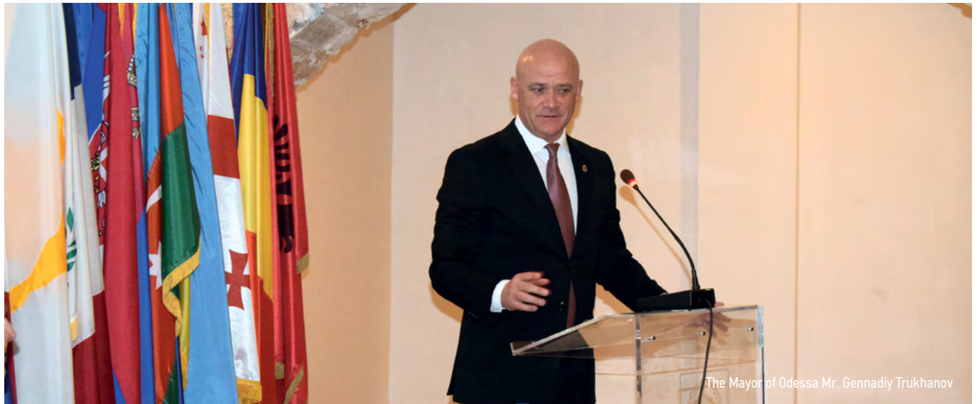
The Mayor of Odessa Mr. Gennadiy Trukhanov

The activities of the Institute, as a think tank, to encourage debate and exchange of views on important issues concerning the Mediterranean area, for the period 2017-2018, included the following important events and thematics: