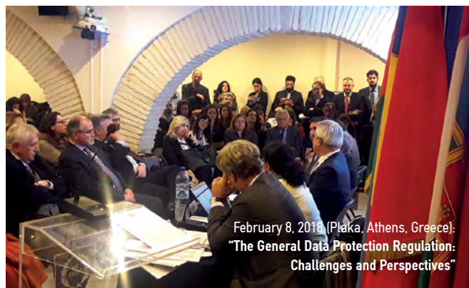
February 8, 2018 (Plaka, Athens, Greece): "The General Data Protection Regulation: Challenges and Perspectives"

Two more volumes are in the course of being published containing the transcripts of our events on E-Justice and on Public Procurement.