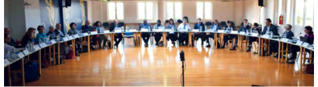
Expert Group Meeting on "Integrity and Ethics" EPLO Sounion premises, Attica, Greece

An Expert Group Meeting on "Integrity and Ethics" was hosted by the EPLO at its premises in Sounion on 29 and 30 November 2017. The meeting was organized by the UNODC as part of the Education for Justice (E4J) initiative and brought together academic experts from various parts of the world to review and validate university modules on integrity and ethics as well as related interactive tools and resources.