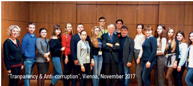
"Transparency & Anti-corruption", Vienna, November 2017