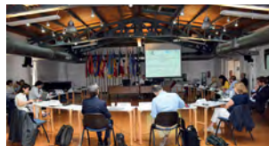
ELGS & University of Oslo Conference on EU's Trade and Investment Agreements EPLO Sounion premises, Attica, Greece

ELGS & the University of Oslo organized a Conference open to the public on EU's Trade and Investment Agreements: Constitutional and substantive issues.