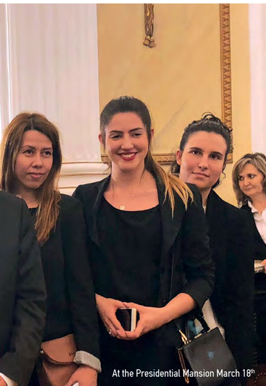
At the Presidential Mansion March 18 th