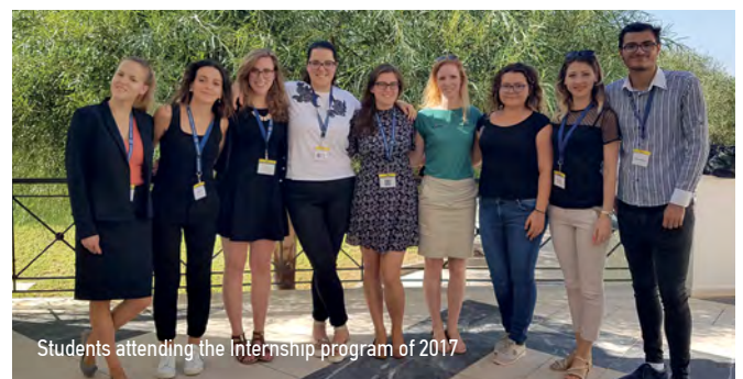
Students attending the Internship program of 2017

In the long term, interns further explore potential career opportunities, become part of a greater network, and develop transferrable professional and personal skills which will help them learn to manage complex situations.