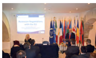
Lecture on "Serbia's European Perspective" EPLO Plaka premises, Athens, Greece