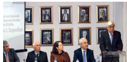
Commemoration Event for Nicolas Saripolos, the founder of Constitutional Law in Greece EPLO premises, Kolonaki, Greece

The Hellenic Parliament, the European University of Cyprus and the European Public Law Organization (EPLO) organized an event, commemorating the founder of Constitutional Law in Greece, Nicolas Saripolos. H.E. the President of the Hellenic Republic Mr. Prokopios Pavlopoulos honored the event with His presence.