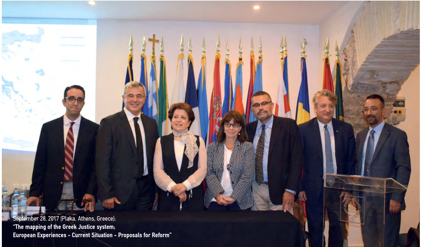
September 28, 2017 (Plaka, Athens, Greece): “The mapping of the Greek Justice system; European Experiences - Current Situation - Proposals for Reform”