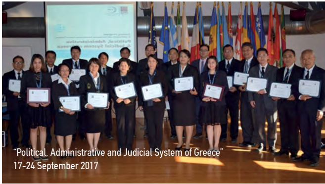
"Political, Administrative and Judicial System of Greece" 17-24 September 2017

The ATHR has been collaborating with RANEPА (Russian Presidential Academy of National Economy and Public Administration) since 2013 through a four-folded program taking place annually in Vienna ("Transparency & Anti-corruption", 6-10.11.2017), Sounion ("International Law & Diplomacy", 20-25.11.2017), Strasbourg ("Council of Europe - European Court of Human Rights", 20-25.03.2018) and Geneva ("The United Nations System", fall 2018). Lectures are conducted by international experts; study visits, workshops and simulations are included in the curricula.