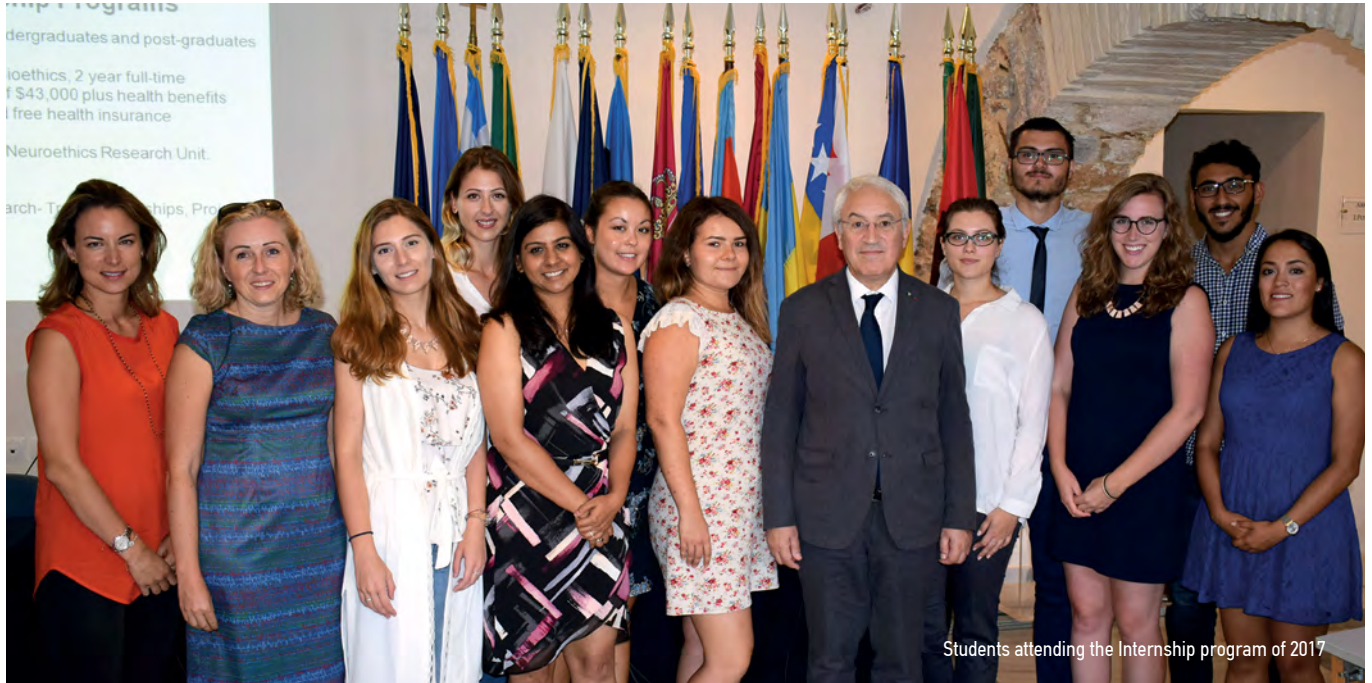
Students attending the Internship program of 2017

During the 2017-2018 academic year the EPLA continued to recruit for its internship program several hundreds of alumni from throughout the world. The objective of the internship program is primarily two-fold: to provide interns with an opportunity to develop professionally and personally, and to provide staff of the EPLA with assistance and access to fresh talent and skills.