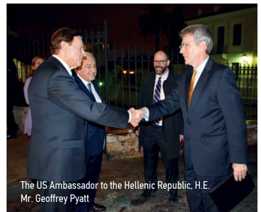
The US Ambassador to the Hellenic Republic, H.E. Mr. Geoffrey Pyatt