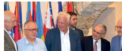
Lecture on the Cyprus problem EPLO Plaka premises, Athens, Greece

An International lecture was organized in honor of H.E. Mr. Ioannis Kasoulides, former Minister of Foreign Affairs of Cyprus, who addressed the topic: "Ideas and thoughts on the problem of Cyprus". The event honored with their presence numerous Ambassadors, diplomats, politicians, and other significant members of the judiciary and the academic community.