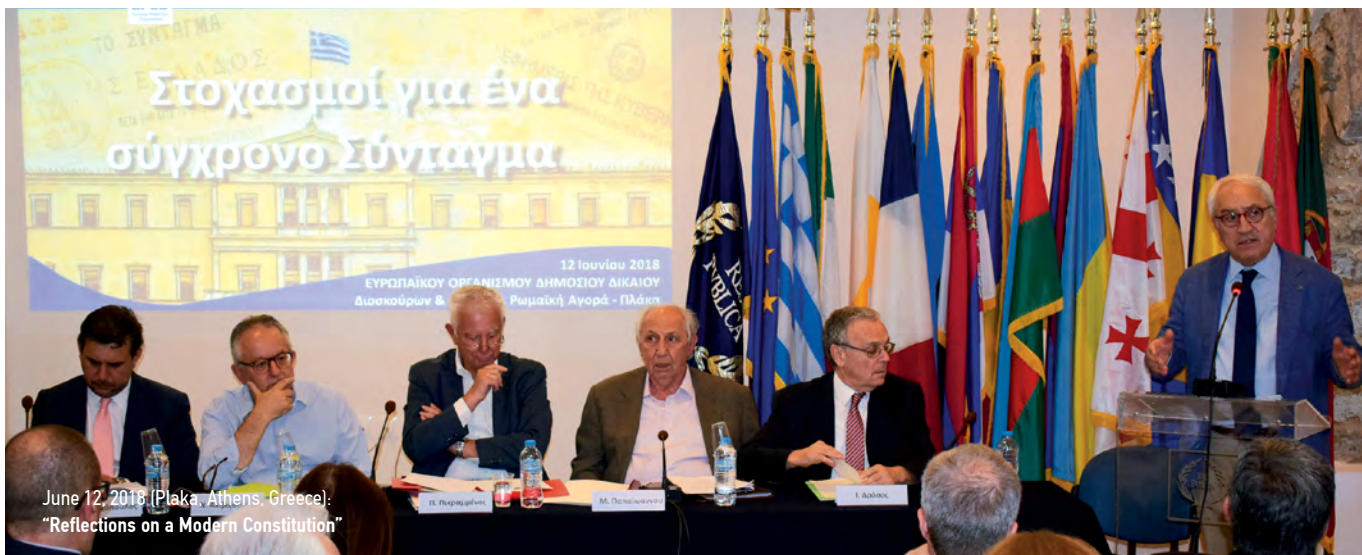
June 12, 2018 (Plaka, Athens, Greece): "Reflections on a Modern Constitution"