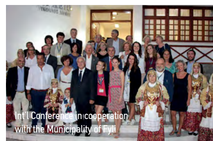
Int'l Conference in cooperation with the Municipality of Fyfi