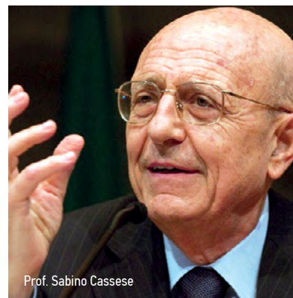
Prof. Sabino Cassese