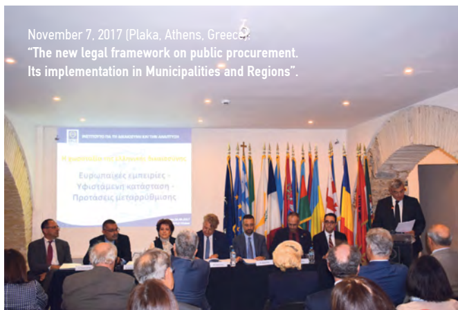
November 7, 2017 (Plaka, Athens, Greece): “The new legal framework on public procurement. Its implementation in Municipalities and Regions”.